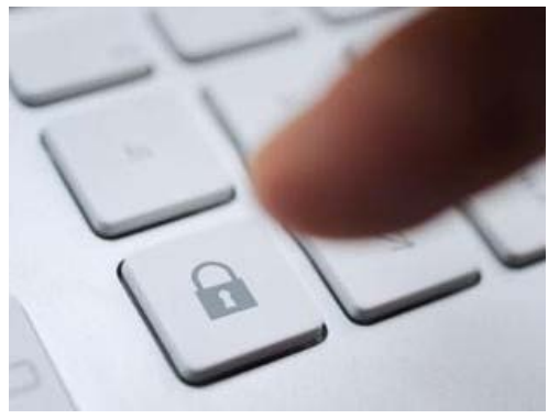
The privacy awareness about issues in public places was also low, says the study entitled 'Privacy in India: Attitudes and Awareness V 2.0'.

NEW DELHI: Giving an insight into privacy perceptions in India in the wake of huge development in the IT sector, one of the first studies on the subject says a majority of people are ignorant about various privacy issues related to the Internet and online social media , including Facebook .