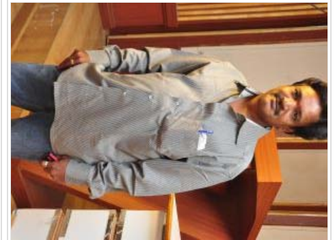
Hyderabad: Telugu movie 'Rangam Modadayyindi' audio release

Enter your name and email below and post your comment.