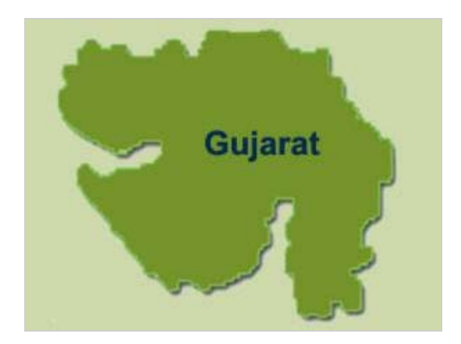
GUJCET 2014: Online choice filling dates will be announced very soon