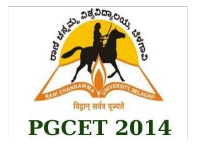
Karnataka PGCET 2014 on June 30; last day to apply is June 24