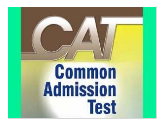
CAT 2014 online registration commences from August first week