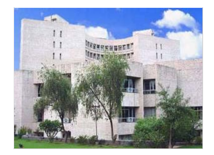
IIFT offers MBA in IB (weekend programme) at Kolkata Campus